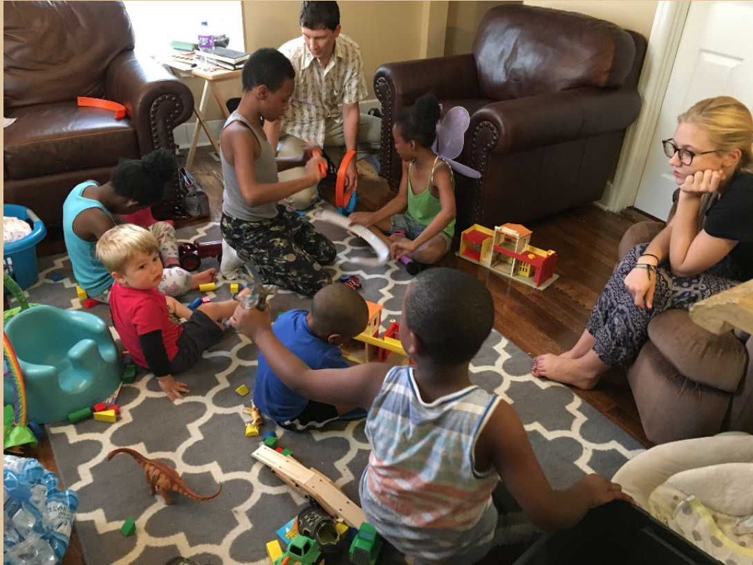
Our neighborhood kids are such a special part of our lives here. We're all in the Nashville Public Library's Reading program and they often come over and play